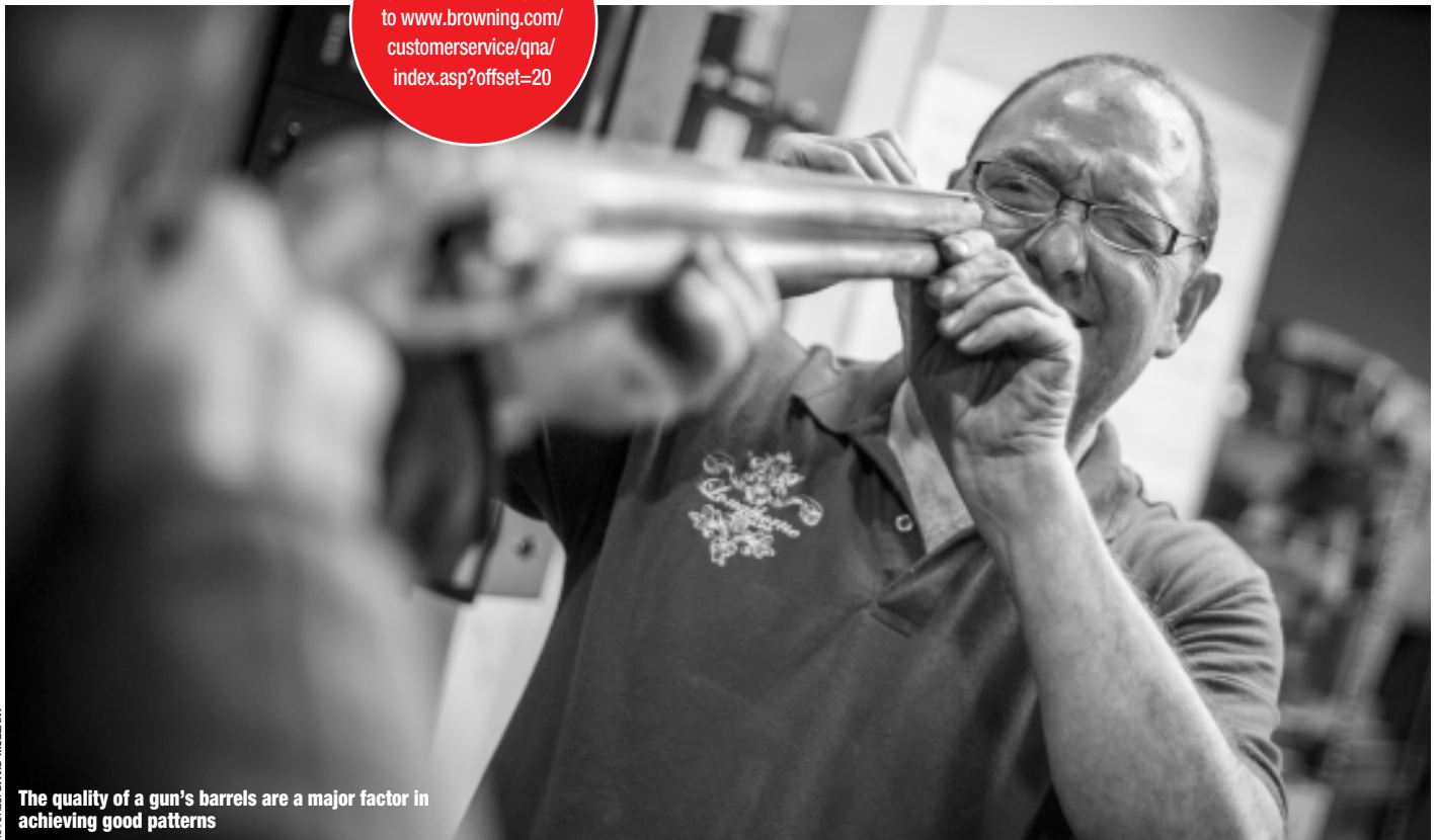
The quality of a gun's barrels are a major factor in achieving good patterns

For a useful guide to patterning, go to www.browning.com/customer-service/qna/index.asp?offset=20