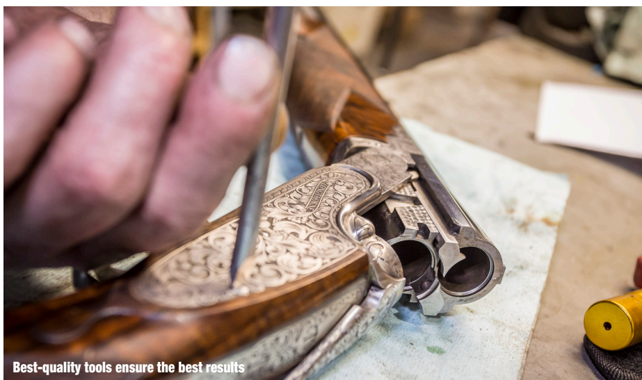
Best-quality tools ensure the best results

The only power we were allowed to use was a pillar drill to drill a hole in the plate in the middle of the square; the rest of it had to be achieved using a hammer, different chisels, files, emery paper and polishing stones. It was basically an exercise