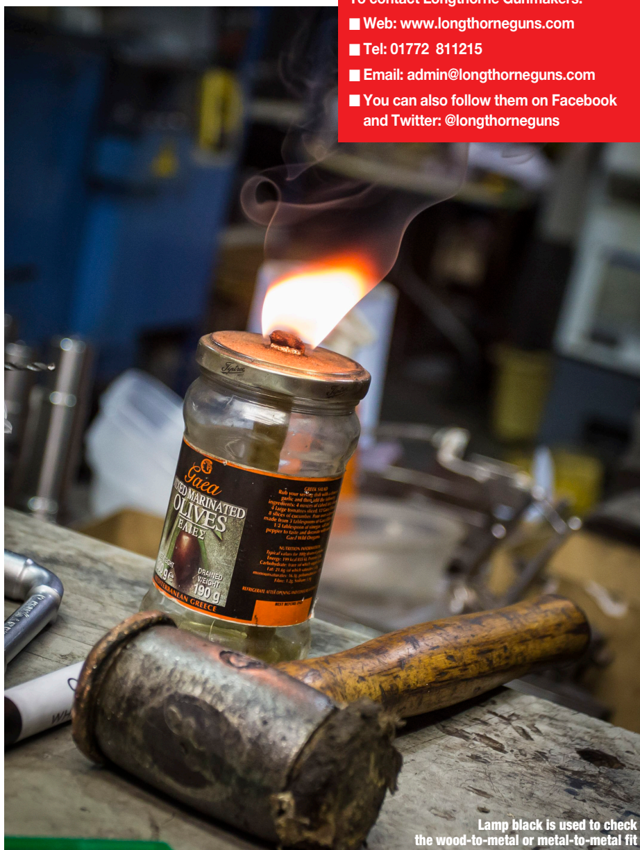
Lamp black is used to check the wood-to-metal or metal-to-metal fit